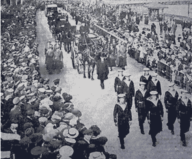
Nurse Cavell returns home

Nurse Edith Cavell, shot in Belgium in October 1915 by the enemy for treason, was one of the three unfortunates whose bodies traveled in luggage van 132 to their final resting places after repatriation through Dover.