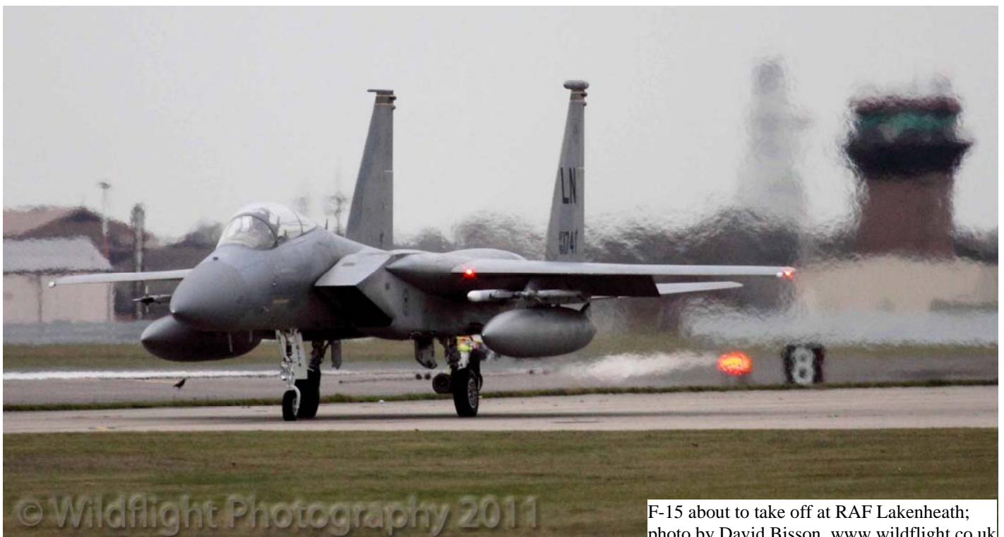
F-15 about to take off at RAF Lakenheath

We visited RAF Lakenheath, used as a Royal Flying Corps airfield during the Great War. Though abandoned in 1918, the airfield came into operation again in 1940 as a decoy airfield for RAF Mildenhall, nearby. They are now the two main bases in the UK operated by the US Air Force.